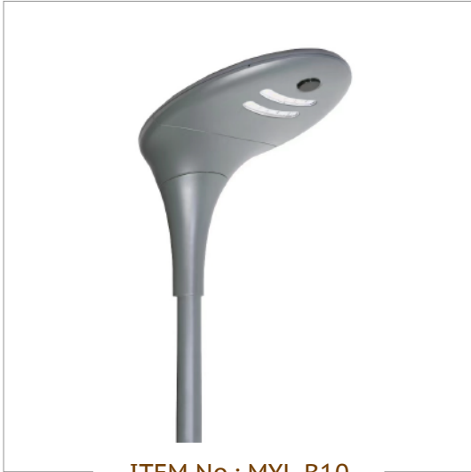
ITEM No.: MYL-B10