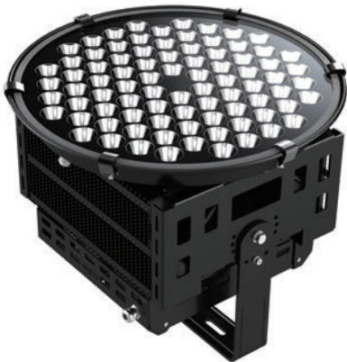
ITEM No.: MFL-T500